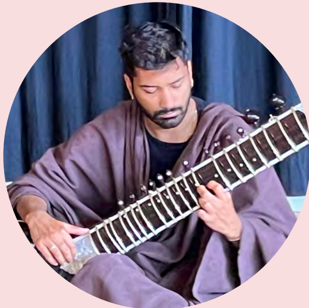
Image: Music workshop with artist in school

Weekly workshops to support the music curriculum (half/full day).