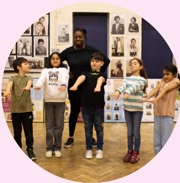
Image: Scene from My Journey, My Birmingham drama session

The programme which is suited for one class (max thirty two children), is one hour long and can be booked before, during, or after your From City of Empire to City of Diversity: A Visual Journey schools exhibition.