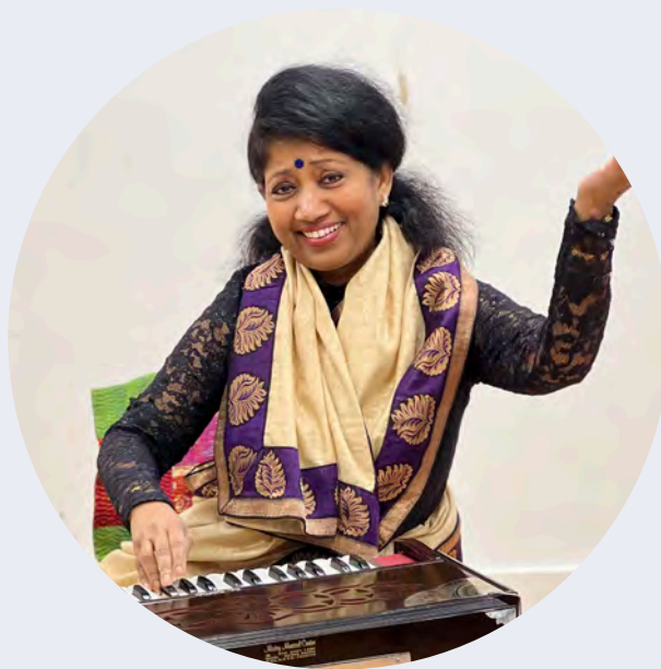
Image: Musician workshop and performance

KS3, KS4, KS5 Musician Residency (1 day) 2 assemblies + a 90 minute session with your music group, £485