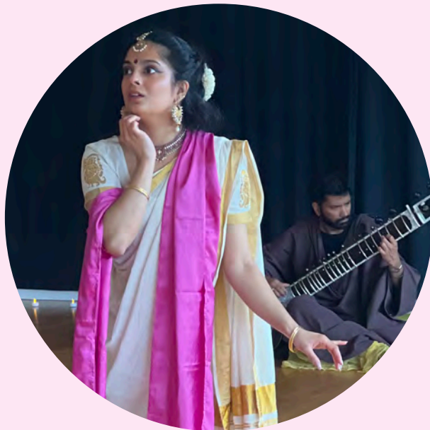
Image: Spirit of Light schools performance

3 same day performances: £900 (£720 Sapphire, £765 Emerald, £810 Ruby)