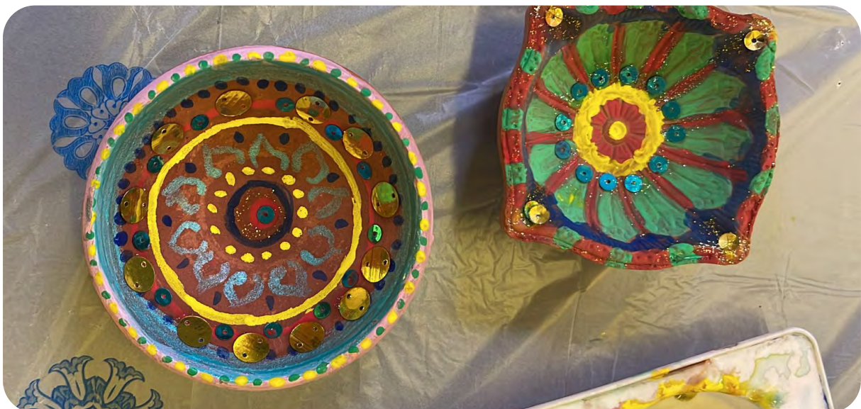
Image: Diwali craft workshop

Please enquire on 0121 446 3260 or learning@sampad.org.uk for further details