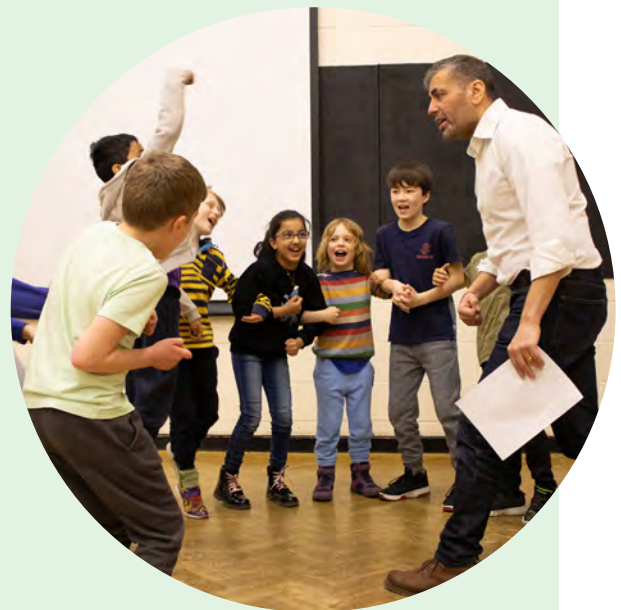
Image: Drama workshop

Have a play in a week as part of your Arts Week Activities.